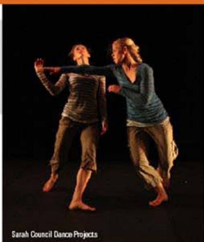
Sarah Council Dance Projects

DEC 11 and 13 at 8 PM GEN. $18/ SEN. $15